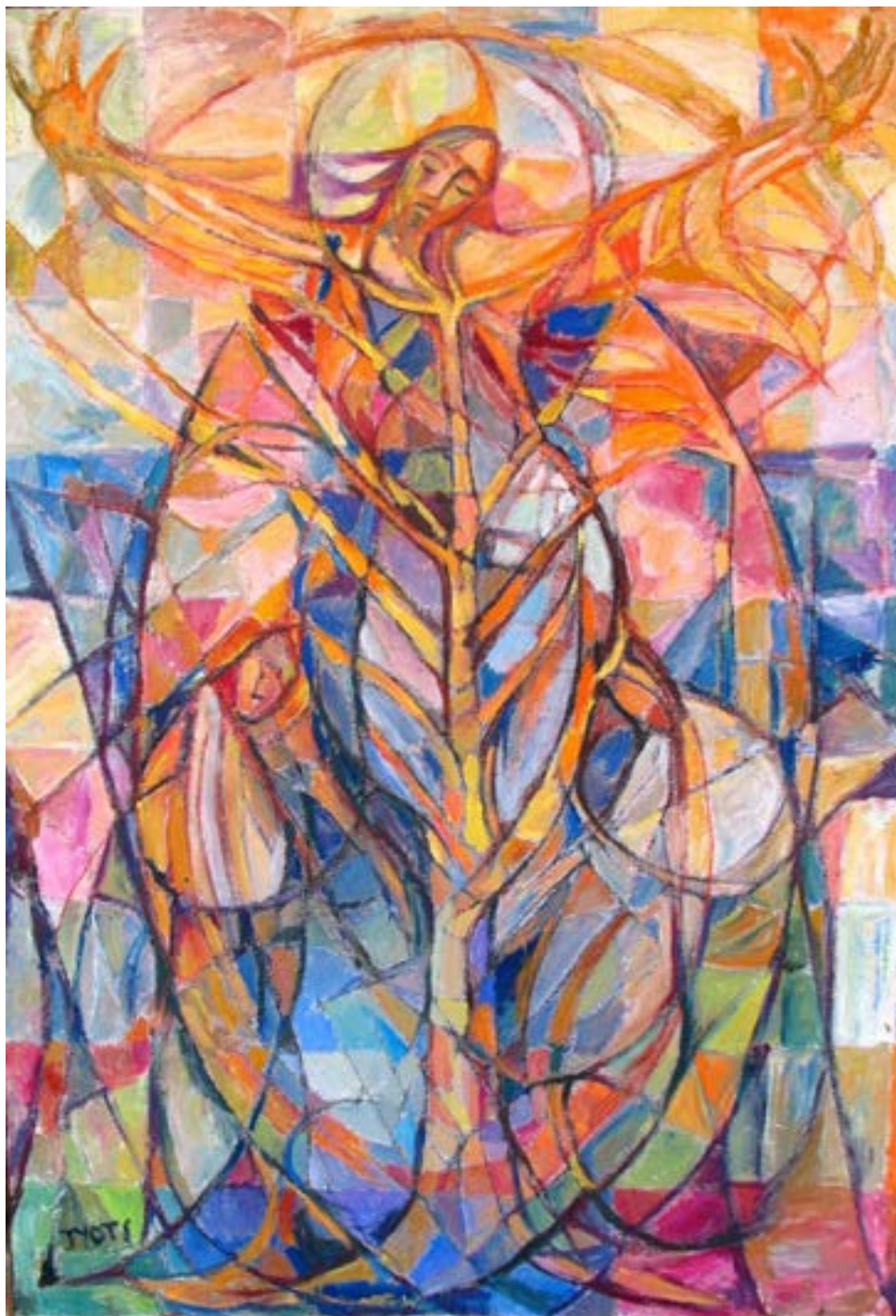
Jyoti Sahi (b. 1944), Resurrection , 2007. Oil on canvas.